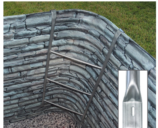
Corner-Step™ Egress Ladder on a STONEWALL™ well